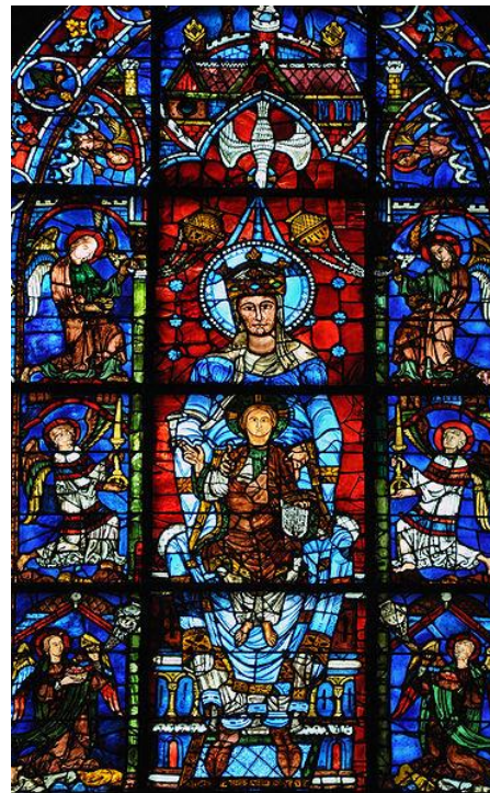
Notre-Dame de la Belle Verrière

The city is both a beautiful place to visit and the center of an area full of Middle Ages and Renaissance wonders.